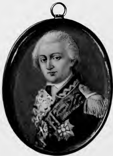
Admiral, Lord Rodney By John Singleton Copley Page 56